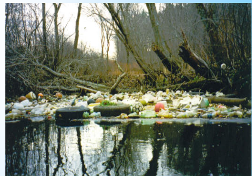
Litter in a stream.