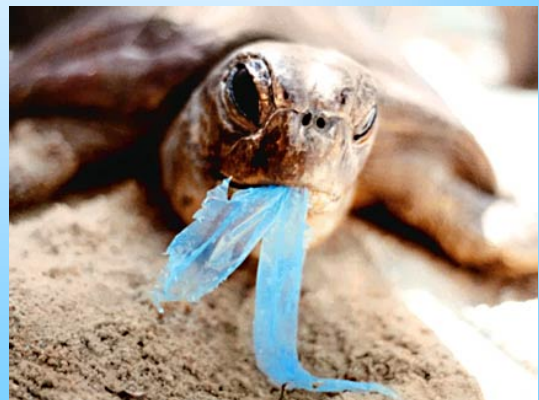
Turtles mistake plastic for jellyfish, a common food source.